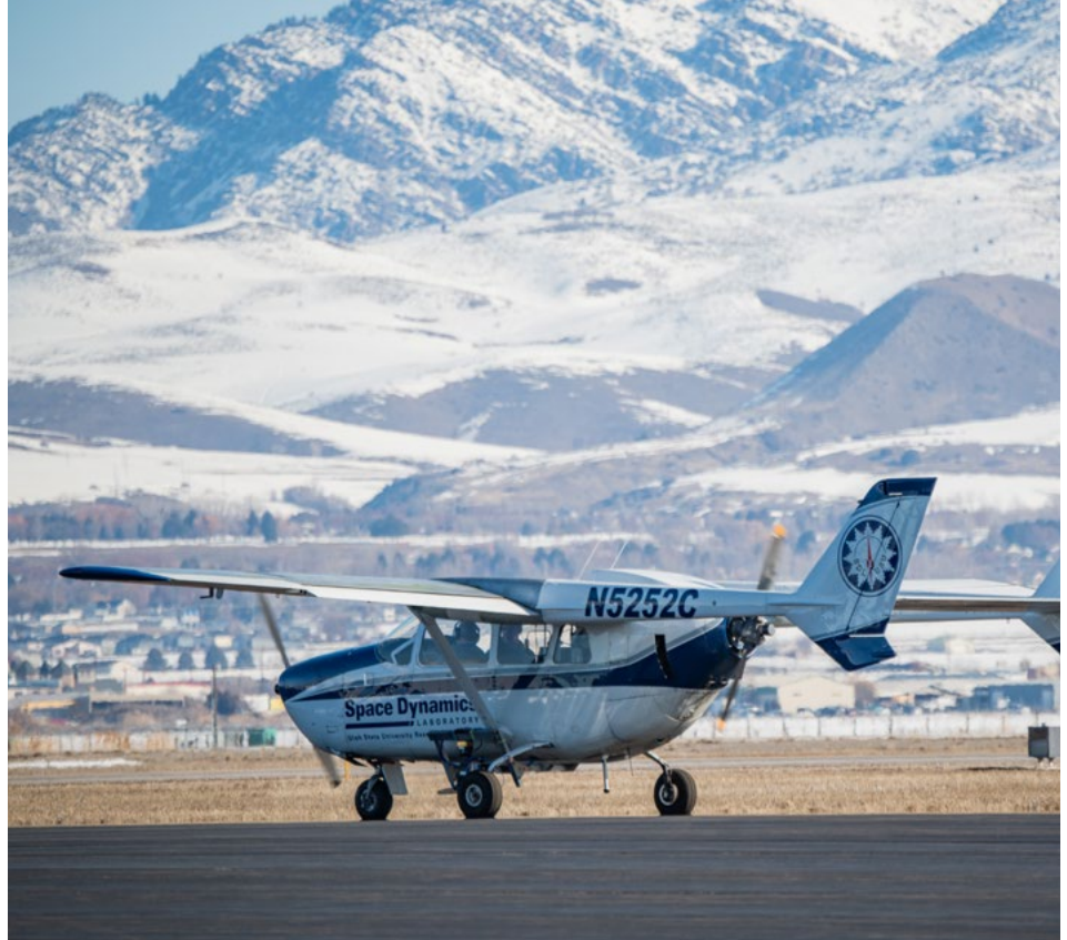
SDL Skymaster aircraft with FlexSAR.

(2) Cessna Skymaster O-2 manned aircraft can carry a total payload of up to 450 lbs and 2 kW. It features 22 U of rack space, four wing hardpoints for sensor installation, and inline twin engines for very stable flight. GPS/INS is available.