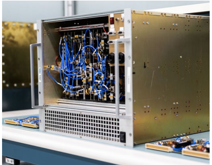
FlexSAR in the VME chassis.

FlexSAR is a low-cost imaging system built on an extensible radio frequency (RF) architecture and supported by software-defined radio for waveform generation and sampling. This system emulates bat echolocation adaptivity in its ability to adjust to evolving conditions and modes. The FlexSAR system is easily modified to accommodate new capabilities and/or changing conditions, with modification timelines measured in weeks rather than years.