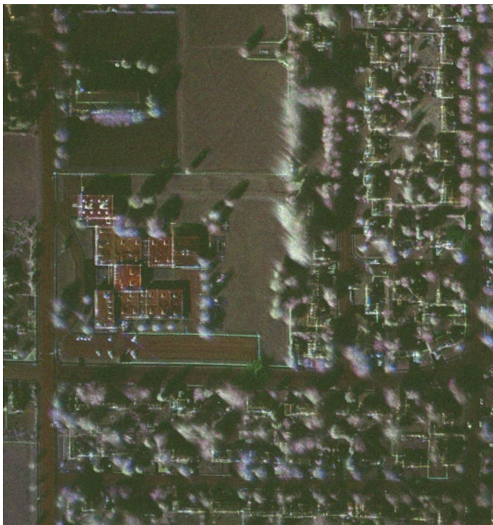
Quad-polarized Ku-band FlexSAR image.