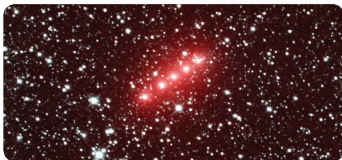
Comet C/2014 Q2, also known as Lovejoy, is one of the many comets imaged by NASA's NEOWISE mission.

The Jet Propulsion Laboratory (JPL) manages the NEOWISE mission