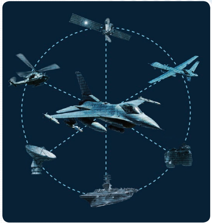
Multi-domain cyber solutions

SDL's experience with systems security engineering includes successful development and execution of strategies and solutions for attack surface mapping, network awareness, penetration testing, intrusion detection/prevention, and cyber exercise execution.