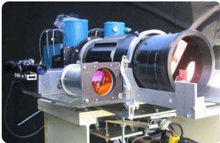
Two Santa Barbara Focalplane infrared cameras were used to collect high-speed imagery (> 2,000 fps) of a rocket launch at the Kennedy Space Center

The software can be configured at the source code level to support different types of hardware interfaces, control protocols, and input and output formats. It can also be tailored to create and embed frame headers during image storage, or decode and display metadata that is already embedded in the data stream.